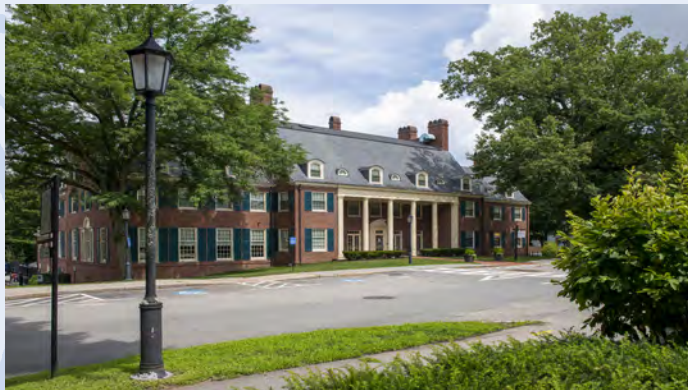
Home to Phillips Academy - the Oldest Boarding School in the Country.